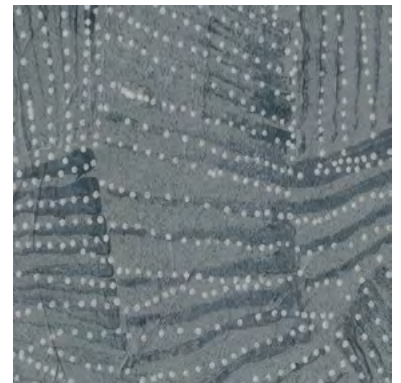
Yalgu Nightsky White core