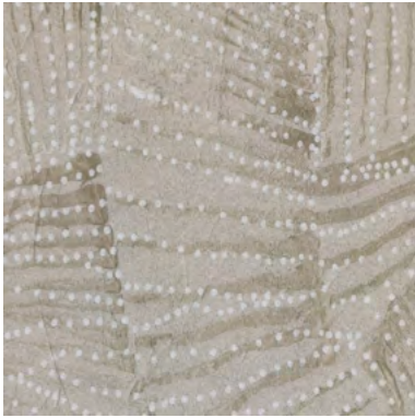
Yalgu Stringybark White core