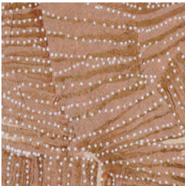
Yalgu Tamarind White core