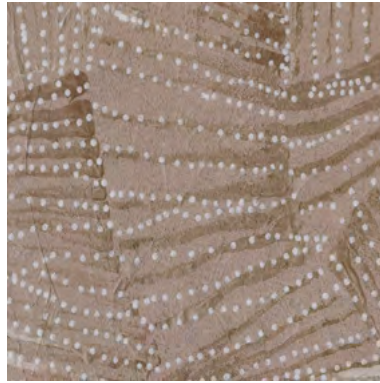
Yalgu Brushwood White core