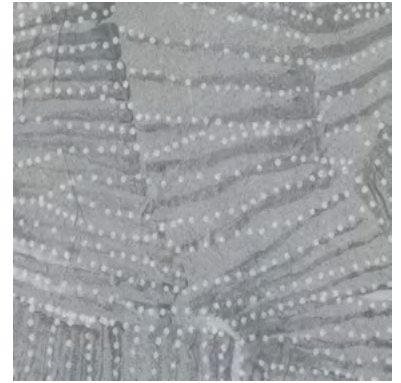
Yalgu Silvergum White core