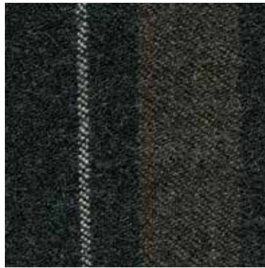
FEEL STRIPE Savile Row