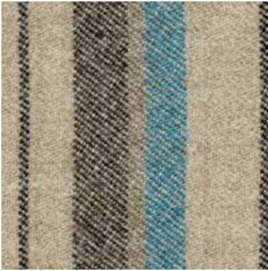
FEEL STRIPE Lido