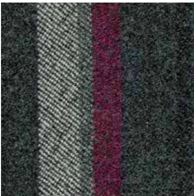
FEEL STRIPE Vine

Product may vary in colour due to the nature of the media Patterns shown are not to scale Please refer to website for current colour range