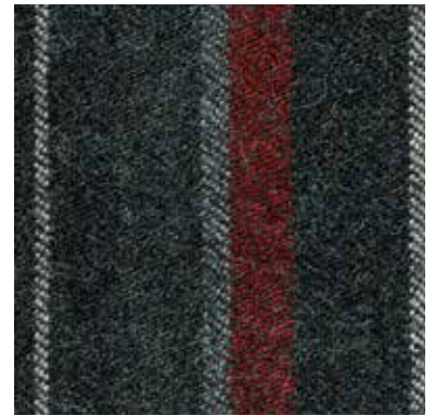
FEEL STRIPE Berry