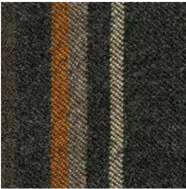
FEEL STRIPE Jaffa