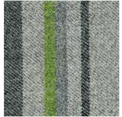
FEEL STRIPE Kiwi