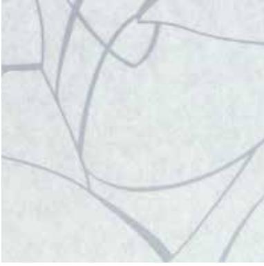
OPUS Ivory on Opal