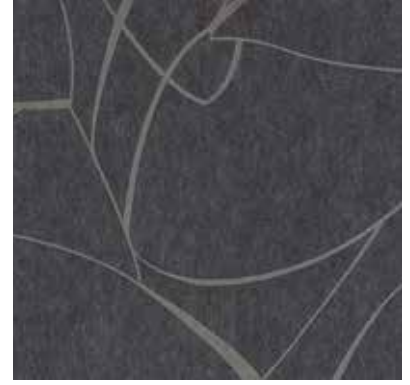
OPUS Putty on Charcoal