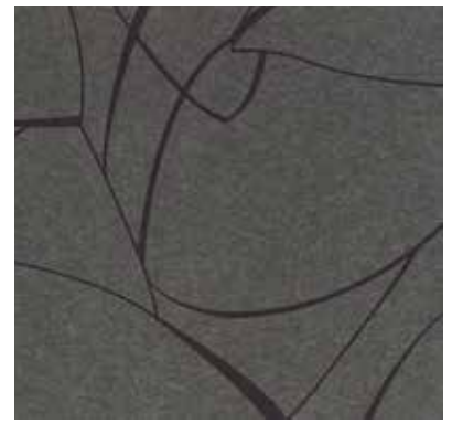
OPUS Black on Taupe

Patterns shown are not to scale Product may vary in colour due to the nature of the media Please refer to website for current colour range