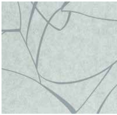
OPUS Shadow on Fresco