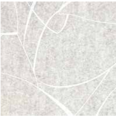
OPUS White on Natural