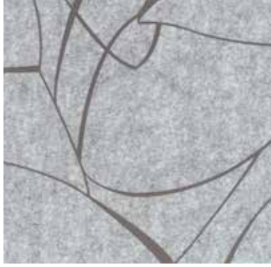
OPUS Putty on Light Grey