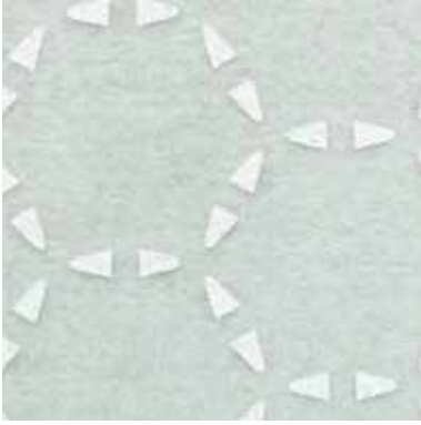
DISC White on White