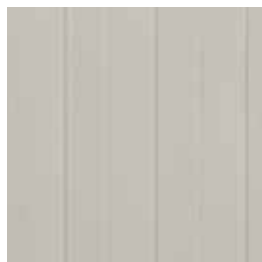
Matte White 180-STM