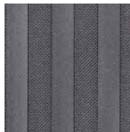
Dark Silver 192-ST12