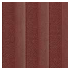
Brite Penny 193-ST13

Patterns shown are not to scale Product may vary in colour due to the nature of the media Please refer to website for current colour range