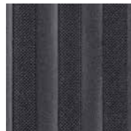
Black Pearl 189-ST9