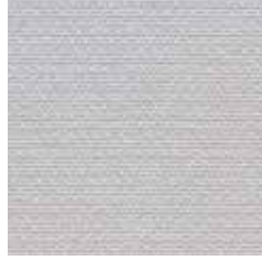
MOJO On It