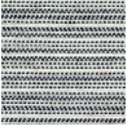
EPIC Car Chase