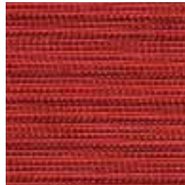
EPIC Love Story